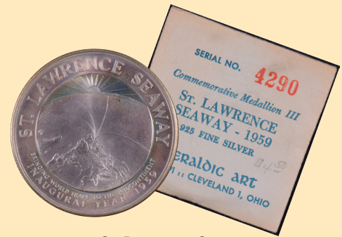
1959 St. Lawrence Seaway

The U.S. Mint ceased to issue commemorative coinage in 1954 amidst the controversy surrounding the sale and distribution of several coins. Commemorative coins were still popular, and many noteworthy anniversaries and events were passing without a means for recognition. In 1959, the Heraldic Art Company of Cleveland, Ohio began issuing half dollar size sterling silver medallions commemorating events of national significance. These medallions were made to specifically supplement the U.S. Commemorative Half Dollar series.