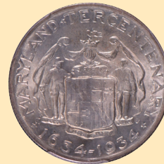
1934 Maryland Tercentary Half Dollar