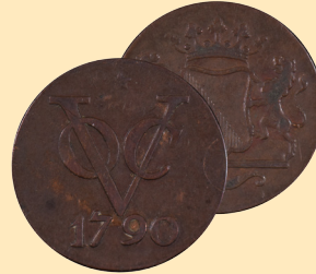
New York "Penny"