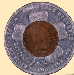
Encased Indian Cent