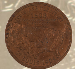
Louisiana Purchase Exposition Medal