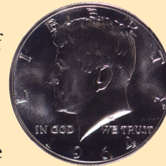
1964 Kennedy Half Dollar

➤ 1964 Kennedy Half Dollar – This is a memorial of John F. Kennedy’s death.