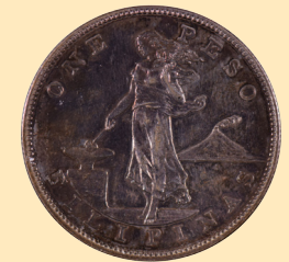
1903 Philippines Peso