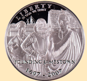
Jamestown 400th Anniversary Silver Dollar