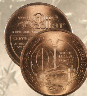
Century 21 Exposition, Seattle Medal