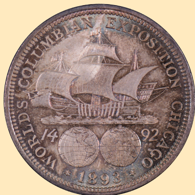
1893 Columbian Exposition Half Dollar Reverse

By the mid-Nineteenth Century, the United States of America had celebrated many important milestones and events. Citizens often wanted mementos of these occasions and private companies filled this demand for some events by selling commemorative medals. The United States Mint recognized the strong interest for commemoratives of national events and issued official medals on special occasions such as the U.S. Centennial of Independence. These commemorative medals were popular, but lacked the full 'legitimacy' of a legal tender issue. The U.S. Mint first issued commemorative coinage in 1892 in conjunction with the World's Columbian Exposition held in Chicago to commemorate the 400th anniversary of Columbus' landing in the 'New World'. Nearly two million Columbian Halves were struck in 1892 and 1893. Many of these were bought as prized keepsakes of their attendance at this once in a lifetime event. The success of this first issue paved the way for more commemorative coins to be issued; again in conjunction with Expositions. These included the Lafayette Dollar (Paris Exposition, 1900), the Jefferson, McKinley, and Lewis & Clark Gold Dollars (Louisiana Purchase Exposition, 1904), and the Panama-Pacific Exposition coinage of 1915.