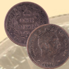
1883 Hawaii Dime