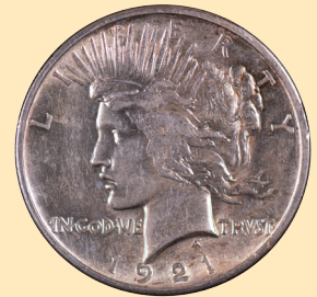
1921 Peace Dollar

➤ 1921 Peace Dollar – This issue observes the end of World War I.