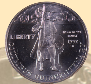
1992 Columbus Silver Dollar