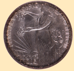
Panama-Pacific Exposition Half Dollar