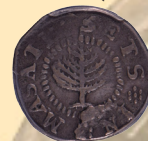
Pine Tree Shilling Sm. Planchet