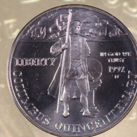
Christopher Columbus Quincentenary Silver Dollar