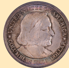
1893 Columbian Half Dollar