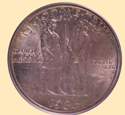
Boone Half Dollar