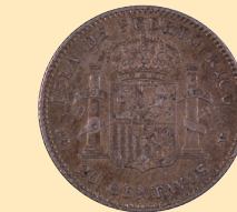
1895 Puerto Rico 20 Centavos