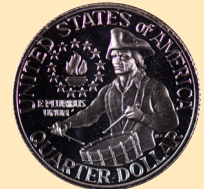
1976 Washington Quarter - reverse

➤ 1976 Washington Quarter – This coin’s reverse portrays the Drummer image to commemorate the Nation’s Bicentennial.