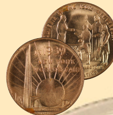
New York World's Fair Medal