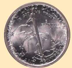
1936 Cleveland Half Dollar