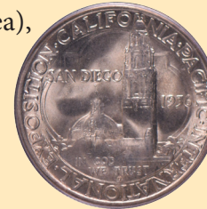
1936-D San Diego Half Dollar