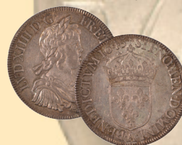
1643 France Ecu