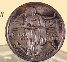
1926 Oregon Trail Half Dollar