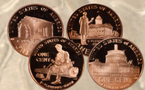
2009 Lincoln Cent Reverse Designs

➤ 2009 Lincoln Cent Designs – The 2009 Lincoln Cent had four different designs depicting stages in the life of Abraham Lincoln. These were issued to mark the bicentennial of Lincoln’s birth.