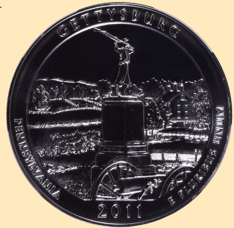
America the Beautiful 5 Ounce Silver Quarter