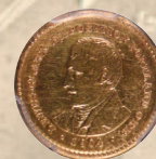
Lewis And Clark Gold Dollar