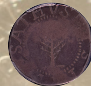
Pine Tree Shilling Lg. Planchet