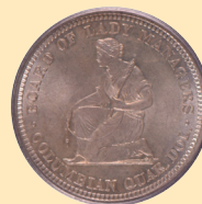
Isabella Quarter reverse