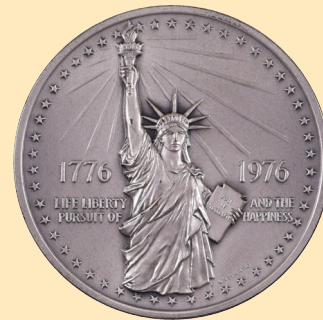
Silver Bicentennial Medal

Note: Each State also issued at least one version of a Bicentennial Medal