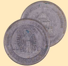
Ferris Wheel Medal