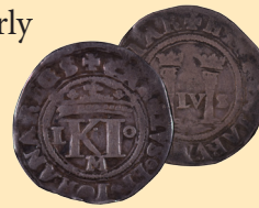
Carlos and Johanna 2 Reales