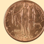
1926 Sesquicentennial Quarter Eagle