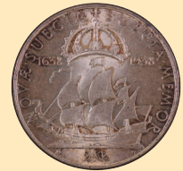
1938 Sweden 2 Kronor