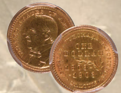
McKinley Gold Dollar