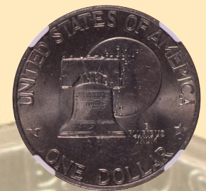
1976 Eisenhower Dollar - reverse

➤ 1976 Eisenhower Dollar – This coin commemorates the Nation’s Bicentennial with a special reverse depicting the Liberty Bell and the Moon. (Also observing the U.S. Moon landing in 1969.)