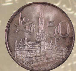
Belgium 50 Francs