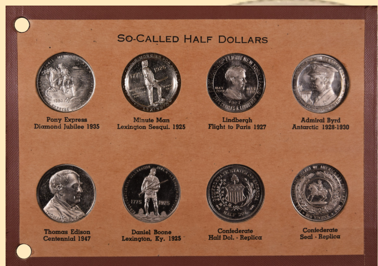
So-Called Half Dollars in Wayte Raymond Holder

Another group of so-called Half Dollars sold by Wayte Raymond in the late 1940's were 8 white metal medallions including: commemoratives of the Battle of Lexington -Concord, Lindbergh's flight to Paris, Admiral Byrd's expedition, 75th Anniversary of the Pony Express, Edison's Birth Centenary, Daniel Boone, Confederate Half Dollar Replica, and Confederate Seal Replica. These are often found as complete sets in their original Wayte Raymond Holders for about $150.00 to $200.00. It makes an interesting collection of commemorative events that were overlooked by the U.S. Mint for want of a supporting committee or because living people such as Lindbergh or Byrd could not appear on U.S. Coins.