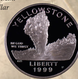
Yellowstone Silver Dollar