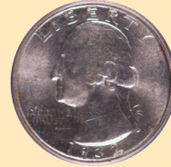
1932 Washington Quarter

➤ 1932 Washington Quarter – This coin marks the Bicentennial of George Washington’s birth.