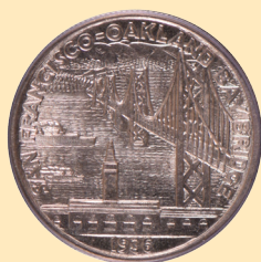
Bay Bridge Half Dollar Reverse

Coin and keep the proceeds in excess of the coin's cost to help pay for the cost of their event or project. Interest in new coin issues grew and commemoratives were struck every year from 1915 to 1939, except for 1919 and 1929 to 1932. These subsequent issues observed primarily statehood anniversaries (Illinois, Alabama, Maine Missouri), milestones in the Nation's development (Pilgrim, Monroe Doctrine, Lexington-Concord, Sesquicentennial, Oregon Trail, Vancouver), and the construction of memorials, monuments and new structures (McKinley, Grant, Stone Mountain, Bay Bridge).