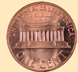
Lincoln Memorial Cent

➤ 1959 Lincoln Memorial Cent – This coin observes the sesquicentennial of Lincoln’s birth.