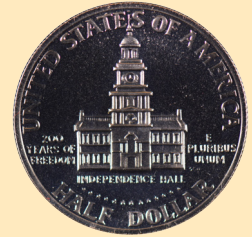
1976 Bicentennial Half Dollar reverse