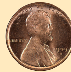
1909 Lincoln Cent

➤ 1909 Lincoln Cent – This issue commemorates the centenary of Abraham Lincoln’s Birth.