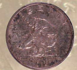
1925 California Half Dollar