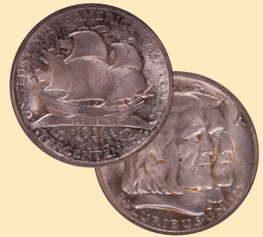
1936 Long Island Tercentary Half Dollar