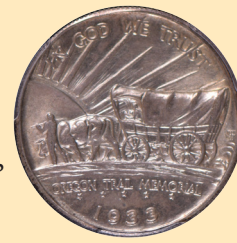
1933 D Oregon Trail Half Dollar