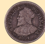
1904 Panama "Pill"