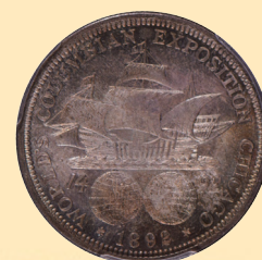
1892 Columbian Exposition Half Dollar