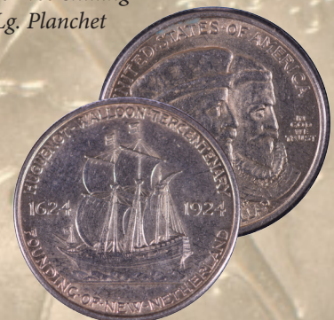
1924 Huguenot-Walloon Tercentary Half Dollar