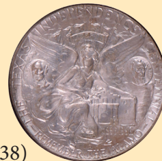
1936-D Texas Half Dollar