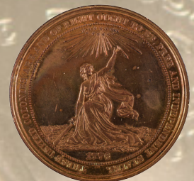
Centennial Medal, Bronze