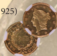
1853 California Mini Gold Half Dollar