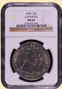
1900 Lafayette Dollar NGC Certified

View Our Inventory of Classic Commemoratives for Sale Here .