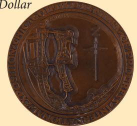
Century of Progress Official Medal