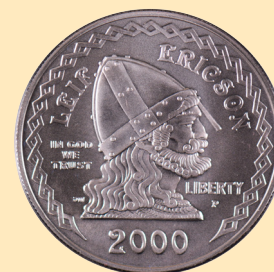
Leif Ericson Millennium Silver Dollar