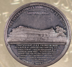
Crystal Palace Medal