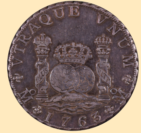
1763 (8 Reales) Pillar Dollar