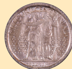
Missouri Centennial Half Dollar Reverse

As numismatics gained popularity in the 1930's, event promoters recognized a golden opportunity and lobbied for an expanding array of commemorative issues. By the mid-1930's commemorative issues were becoming increasingly obscure and distribution methods focused on profiteering rather than contributing to the welfare of the celebrated event. The Cities of Hudson, New York, and Providence, Rhode Island, and York County, Maine had commemorative issues. The Cincinnati Commemorative Half Dollar seemed to commemorate nothing particular at all. Texas and Arkansas issued coins for several years to be sold by distributors at ever higher prices and arbitrary distribution methods. Collectors began to complain about the abuses and Congress reacted by suspending the coinage of commemoratives altogether after 1939. Though Congress was persuaded to authorize a few subsequent issues, (Iowa, Booker T. Washington, Washington-Carver) distribution of those was also botched; further souring the taste for commemorative coinage by collectors and legislators alike. The last of the 'classic' U.S. Commemorative coins was issued in 1954.