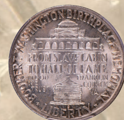
Booker T. Washington Half Dollar Reverse

As numismatics gained popularity in the 1930's, event promoters recognized a golden opportunity and lobbied for an expanding array of commemorative issues. By the mid-1930's commemorative issues were becoming increasingly obscure and distribution methods focused on profiteering rather than contributing to the welfare of the celebrated event. The Cities of Hudson, New York, and Providence, Rhode Island, and York County, Maine had commemorative issues. The Cincinnati Commemorative Half Dollar seemed to commemorate nothing particular at all. Texas and Arkansas issued coins for several years to be sold by distributors at ever higher prices and arbitrary distribution methods. Collectors began to complain about the abuses and Congress reacted by suspending the coinage of commemoratives altogether after 1939. Though Congress was persuaded to authorize a few subsequent issues, (Iowa, Booker T. Washington, Washington-Carver) distribution of those was also botched; further souring the taste for commemorative coinage by collectors and legislators alike. The last of the 'classic' U.S. Commemorative coins was issued in 1954.