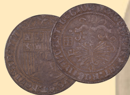
Ferdinand and Isabella Silver Real