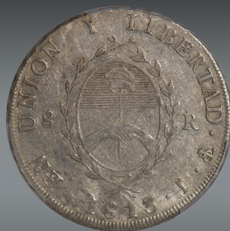
Argentina, 1813-PTS J, 8 Reales, AU50 PCGS Certified - $1,795