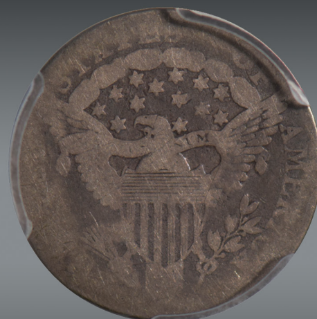
1805 Draped Bust Dime, 4 Berries, AG03 PCGS Certified - $575