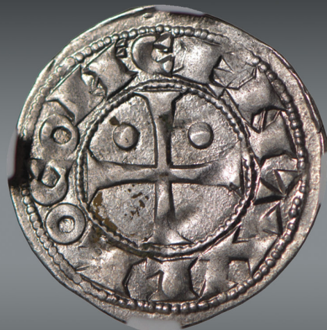
France, Bearn, (1100-1300), Denier MS61 NGC Certified - $175