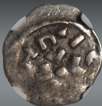
Italy, Lucca, (1035-1125 AD), King Henry III-V, Denier, Genuine NGC Certified - $65