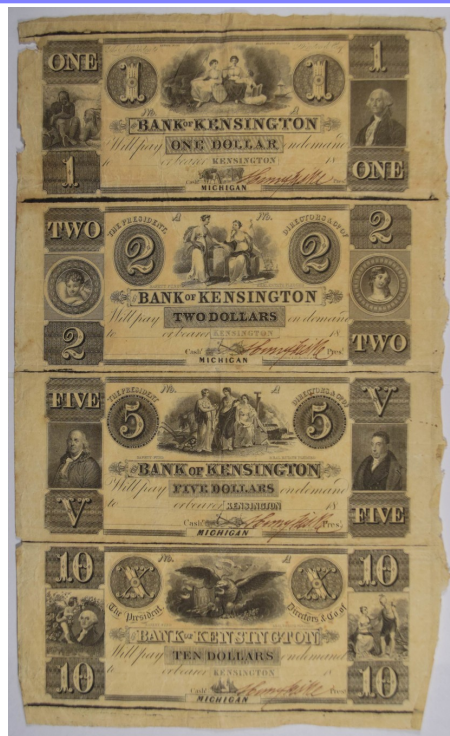
Actual size 12-5/8" high 7-1/2" wide

Sometimes at Liberty Coin Service we choose to sell a great numismatic treasure to one of our customers at a lower price than we might receive if we consigned it to an auction. This amazingly rare Bank of Kensington, Michigan 4-note Currency Sheet is one of those times. The reason we go this route is that we hope someday to have the opportunity to repurchase it from our customer, where that would not happen if we sold it in a major auction.