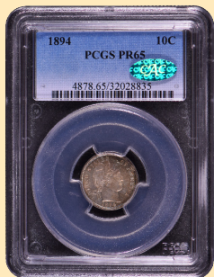
1894 Barber Dime PR65 PCGS

At first glance, a proof Barber Dime set may seem like an impossible set to complete. After all, Proof coins from the late 1800's and early 1900's have low mintages and seem difficult to procure. Upon closer inspection, the Proof Barber Dime collection is quite manageable. There are only 24 coins in the series (25 if you include the 1894-S).