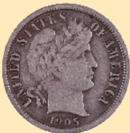
1905-S Barber Dime

View Our Inventory of Barber Dimes for Sale Here .