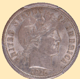
1915 Barber Dime MS61

A Mint State set is a major project, but probably represents decent value if you have the resources to complete it. Consider some of these comparisons: an 1896-O Barber Dime in MS-64 grade has a population of 30 coins graded by PCGS and NGC combined. The last few that sold in auction realized right around $4,000.00. An 1896-O Dollar in the same grade has a certified population of 40 coins and a price over $30,000.00. The 1903-S Barber Dime has a certified population of 12 coins in MS-65! They rarely come to auction, but the last few that did realized around $2,000.00. (The PCGS retail price for this coin is $2,400.00). A 1903-S Morgan Dollar in MS-65 has a certified population of 171 coins and a retail price of $11,500.00! (Though the last few auctioned at about $9,000.00) By comparison, Mint State Barber Dimes are quite rare and inexpensive vis a vis Morgan Dollars. Though Barber Dimes are not nearly so popular as Morgan Dollars, their price/rarity dynamic is truly compelling. If you have the money and patience it takes to build a mint state set of Barber Dimes it is very worthy of your consideration.