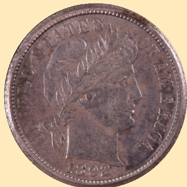
1892 Barber Dime

The Barber Dime (which shared a design with the quarter and half dollar) was introduced in 1892 as a replacement to the long running Liberty Seated series. The coin is named after its designer, Charles E. Barber, the chief engraver at the U.S. Mint. His simple design portrayed the head of Miss Liberty facing right. Though not so embellished, the obverse design resembles both the Morgan Dollar Liberty Portrait and the French 'Ceres' design used on that country's silver coinage from 1849 to 1851. Barber utilized Longacre's 'Cereal Wreath' design first featured on the Seated Dime in 1860 for the coin's reverse.