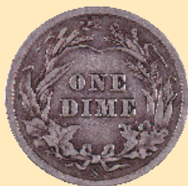
1905-S Barber Dime Reverse

The series does feature one of the legendary rarities of United States Coinage: The 1894-S Dime. Only 24 1894-S Barber Dimes were minted for reasons not entirely clear. The most likely explanation is that there was a little extra silver on hand that that needed to be coined in order to balance the books for the Mint's fiscal year ending on June, 30, 1894. Five of the 24 pieces made were destroyed through the means of assay. Several were saved by mint employees; or in the case of three by a local (Ukiah, California) banker. These three coins account for one of the greatest numismatic legends of all time.