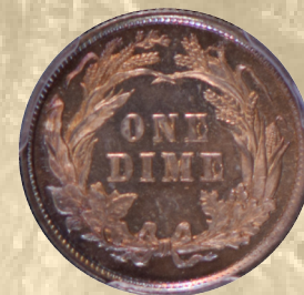
1894 Barber Dime PR65 reverse

Coins in Proof-64 and Proof-65 grades are available and very attractive. Proof-64s typically trade for a bit under $1,000.00. Proof-65s usually trade for a little over $1,000.00. While these are expensive by most collectors' standards, it is not unfathomable for an average collector to save money and purchase one of these coins on a periodic basis. The end result would be a beautiful and impressive collection.