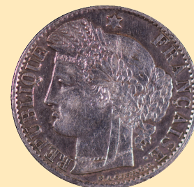
France 'Ceres' Design Series