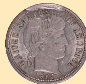
1914 Barber Dime AU

An Extremely Fine or About Uncirculated set would be considerably more difficult and expensive, but rewarding and impressive when finished. Many of the coins will be easy to find. Complete a date set first, then start adding scarcer dates and mintmarks to the mix. As with any collection, aspire to find a consistent look. Many of the key and semi key dates such as the 1895-O, 1903-S, and 1904-S will be tough to find, especially with matching appearance. Be patient when working on this set.