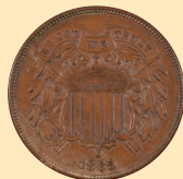
1865 Two Cent