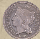
1880 Three Cent Nickel