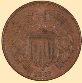
1867 Two Cent Piece