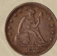
1875 Twenty Cent