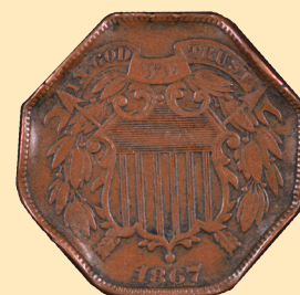
Octagonal Two Cent

There are several interesting varieties in the Two Cent series. There are several coins with repunched features and doubling. Some of the most interesting varieties are the 1864 Large Motto with clashed dies from an Indian Cent and the 1867 Doubled Die Obverse (which is very prominent). As with other Two Cent coins, these are most collectible in grades of very fine or better. The Two Cent series has not been so extensively studied as other series, so there may be more varieties yet to discover.