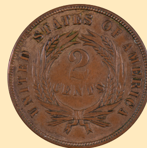
1865 Two Cent Reverse

When the Civil War ended in 1865, the hoarding problem was somewhat alleviated; though very little silver or gold circulated yet. Nickel interests lobbied successfully for the introduction of nickel based three and five cent coins. As these coins debuted, demand for the two cent pieces fell dramatically. Mintages steadily declined over the years. By 1872, Two Cent production was just an afterthought. In 1873, only 600 proof coins were struck for collectors. Many Two Cent pieces were returned to the mint to be melted and re-coined into new cents.