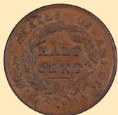
1829 Half Cent

Two cent pieces are frequently collected along with the other 'odd type' coin the Three Cent Piece. Because these types were short-lived series, album makers thought at some time that it was smart to combine both series rather than make separate albums. Both the Two and Three Cent coins are interesting and challenging to collect, so it might be fun and convenient to do so since there are albums already made for this purpose.