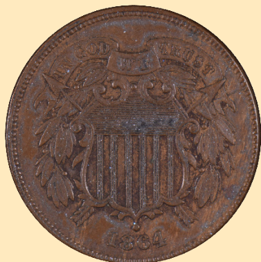
1864 Two Cent

The curious Two Cent piece made its appearance into circulation in the war-torn United States of 1864. Any circulating Federal coinage was scarce during the Civil War as citizens worried by great uncertainty hoarded anything of tangible value in sight. Privately issued 'Patriotic' and merchant tokens helped fill the void left by the missing coinage. Government officials recognized this 'encroachment' on the Mint's proprietary function. In response, the Mint quickly churned out the cheaper to produce bronze cents and Two Cent pieces while Congress outlawed the private issues. Because of their low intrinsic value and sheer numbers, they generally escaped the fate of hoarding. Millions of the bronze cents and Two Cent coins entered circulation to welcoming consumers and merchants alike.