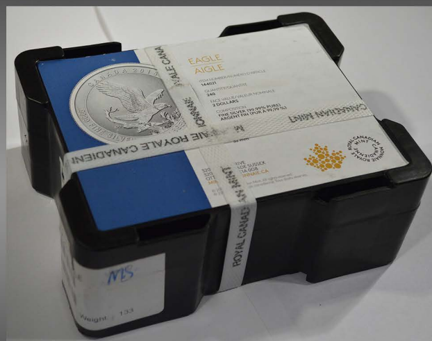
Sealed Mint Box of Canada 2015 $2 Half Ounce Silver Eagle - $2,395