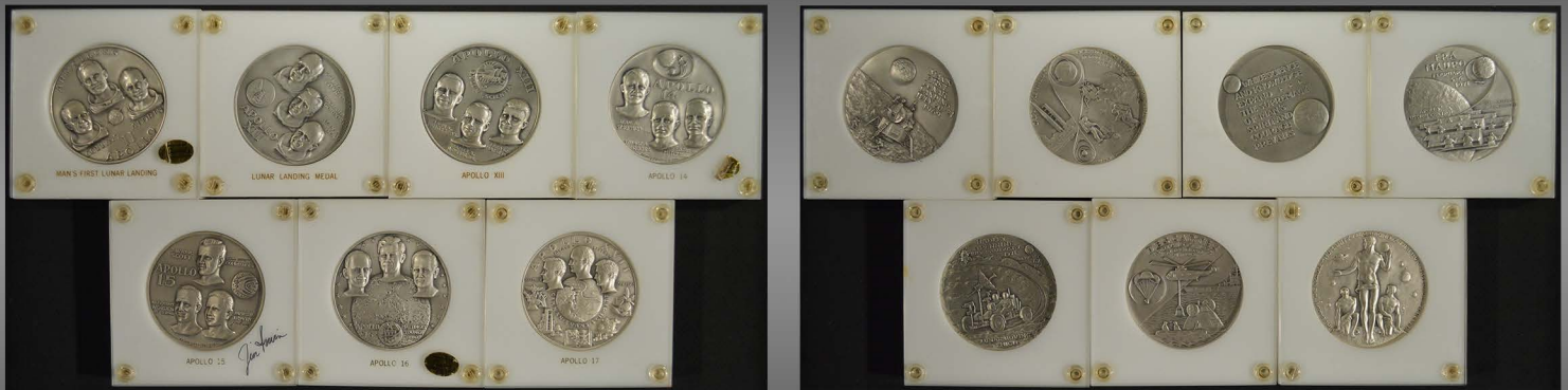
7 Piece Set of .999 Fine Silver Apollo Mission Medals - $895