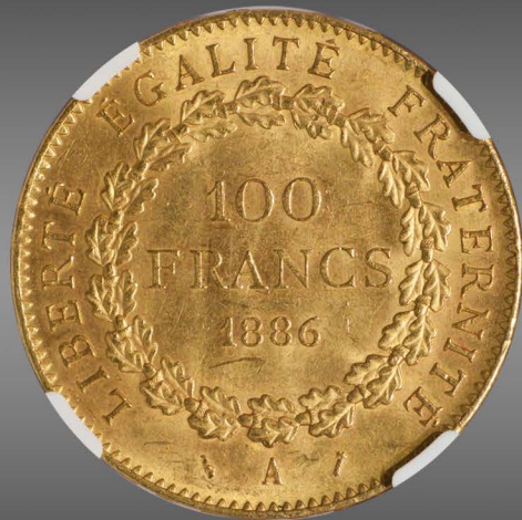
France 1886-A Gold 100 Francs MS63 NGC Certified - $1,695