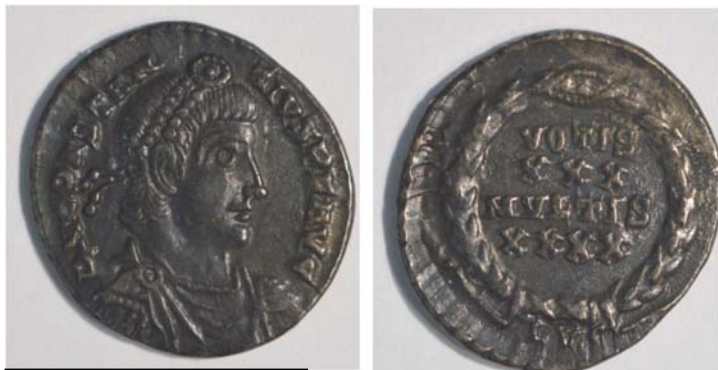
Top to Bottom: Constantius II, Julian II, Valentinian I, Valens, Gratian. Enlarged to show detail; actual coin diameters about 5/8".

Julian II, 361-363 AD, Arles or Lugdunum, France Mint. Constantius II made his cousin, Julian a Caesar in 355 AD. Julian's