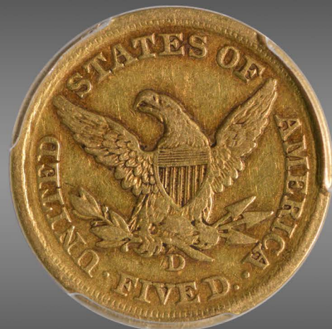
1852-D Gold $5 Liberty XF40 NGC Certified - $1,995