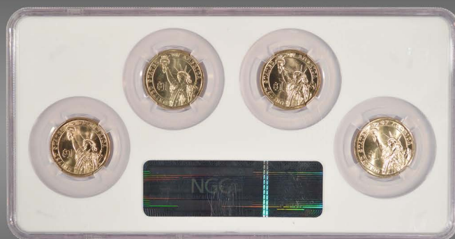
2009 Presidential Dollar 4-coin Set with Missing Edge Lettering BU NGC Certified - $195