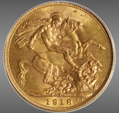
India 1918-I Gold Sovereign MS64 PCGS Certified - $525

1918-I Sov PCGS MS64 India 824801.64/13304198