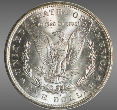
Roll of 20 1888-O Morgan Dollars MS60 or Better - $895 per roll