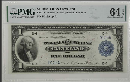
1918 Federal Reserve Note Ch. Unc. 64 EPQ PMG Certified - $595