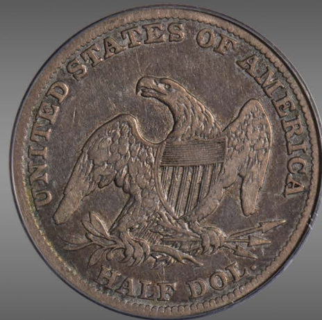
1840 (O) Liberty Seated Half Dollar, Reverse of 1838, VF30 PCGS Certified - $1,295

1840 (O) 50C PCGS VF30 Reverse of 1838 6233.30/12462054