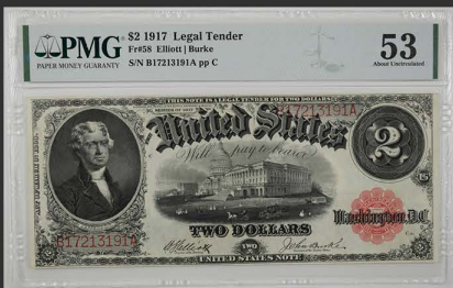
1917 $2 Legal Tender Note AU53 PMG Certified - $275