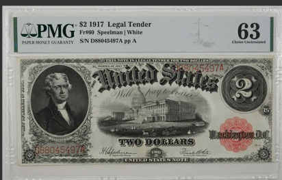
1917 $2 Legal Tender Note Ch. Unc. 63 PMG Certified - $460