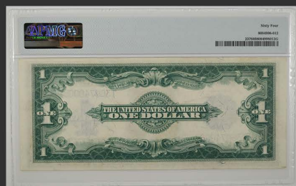
1923 $1 Silver Certificate Ch. Unc. 64 PMG Certified - $150