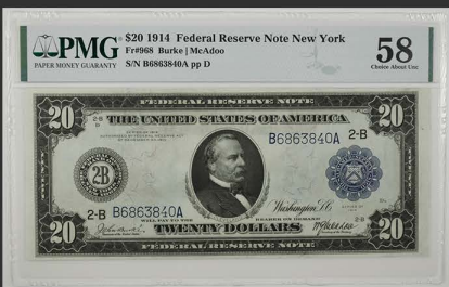
1914 $20 Federal Reserve Note Ch. AU58 PMG Certified - $995