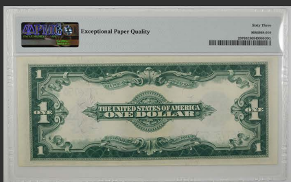
1923 $1 Silver Certificate Ch. Unc. 63 EPQ PMG Certified - $135