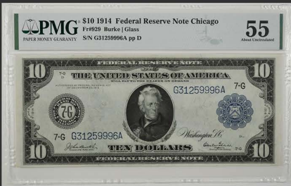
1914 $10 Federal Reserve Note Ch. AU55 PMG Certified - $225