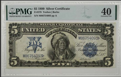
1899 $5 Silver Certificate EF40 PMG Certified - $1,495