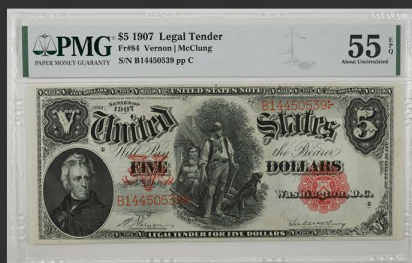
1907 $5 Legal Tender Note Ch. AU55 EPQ PMG Certified - $550