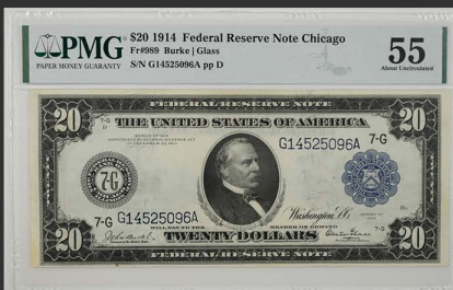
1914 $20 Federal Reserve Note Ch. AU55 PMG Certified - $425