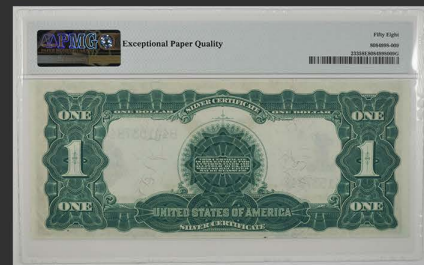
1899 $1 Silver Certificate Ch. AU58 EPQ PMG Certified - $350