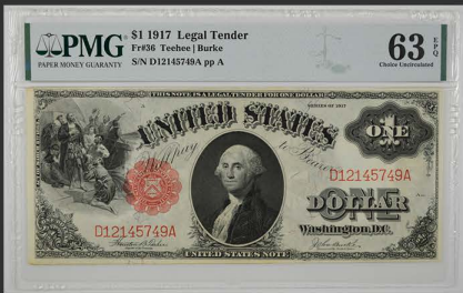
1917 $1 Legal Tender Note Ch. Unc. 63 EPQ PMG Certified - $375