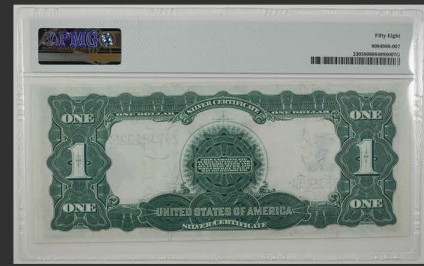
1899 $1 Silver Certificate Ch. AU58 PMG Certified - $350