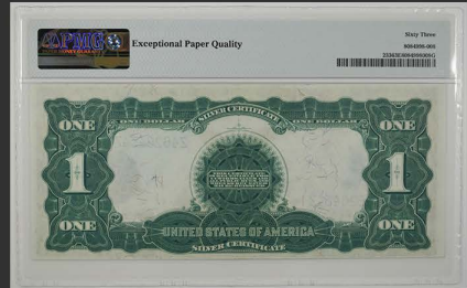
1899 $1 Silver Certificate Ch. Unc. 63 EPQ PMG Certified - $480