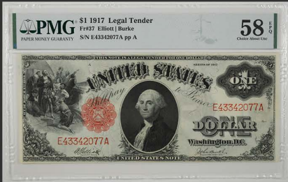
1917 $1 Legal Tender Note Ch. AU58 EPQ PMG Certified - $285