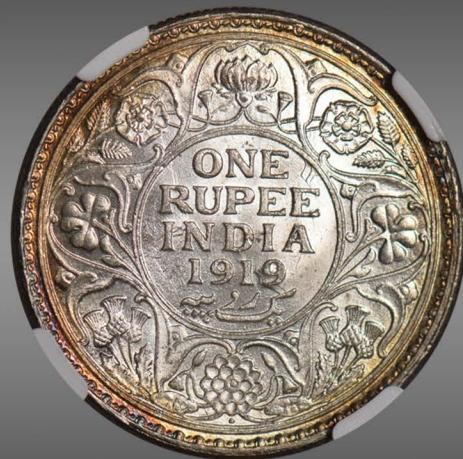
India, 1919(B), Rupee, MS63 NGC Certified - $129