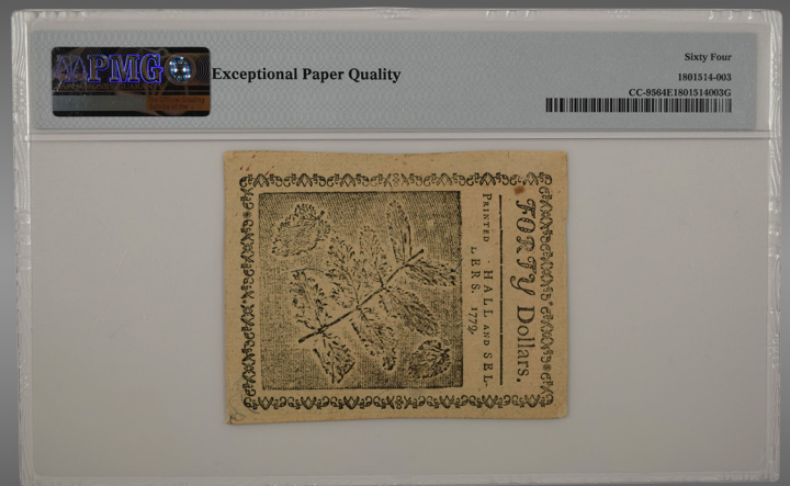
January 14, 1779 $40 Continental Currency Note, Ch. Unc. 64 EPQ PMG - $2,295