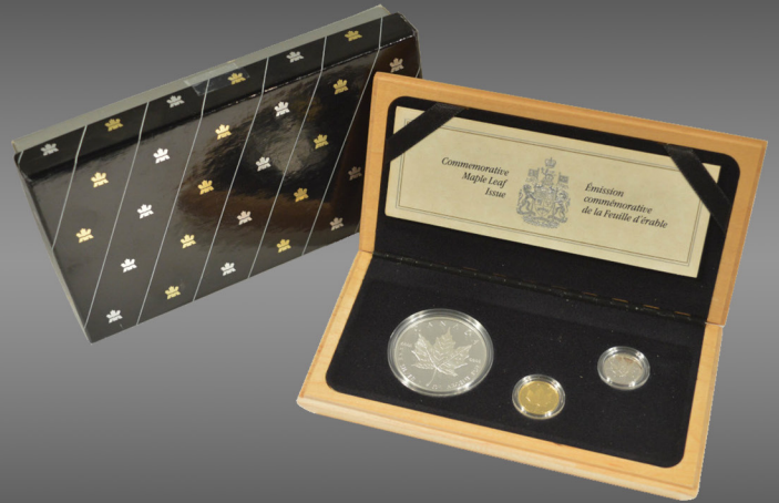
Canada 1989 Maple Leaf Proof Set - $450