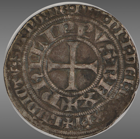
France Philippe IV Silver Gros Turnois, 1285-1314, Very Fine - $175