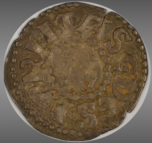
France Silver Denier, City of Lyon, circa 1200, Very Fine - $89