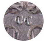
The Carson City mintmark