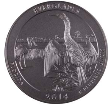
The actual coins shown are larger than pictured—they are a massive 3 inches in diameter!

As with all of our numismatic items, your satisfaction is guaranteed. You have 14 days upon your receipt to return these coins for a full, prompt, no-questions refund.